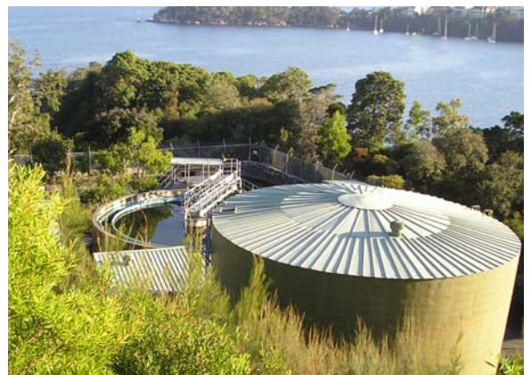
Water Reclamation Plant