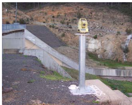
Dam stability survey instrumentation