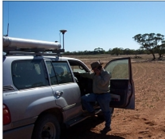
Surveying along the Darling Anabranch pipeline route

SASIS offers expertise in a range of specialist technical areas geared to the needs of Government. This expertise is available to agencies as required from an established in-house service provider. Tailored solutions are continuously developed and implemented and key long-term asset data records are appropriately maintained and accessible when required.