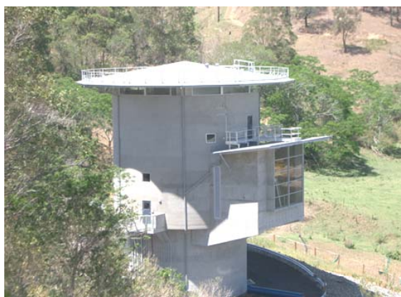
Kooree Island - No. 3 Pumping Station