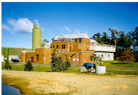
Wingecarribee Water Treatment Plant